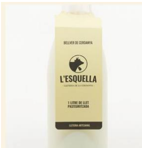
Llet fresca pasteuritzada