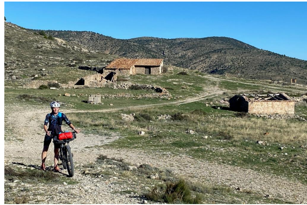
Sierra de Albarracín (Teruel)