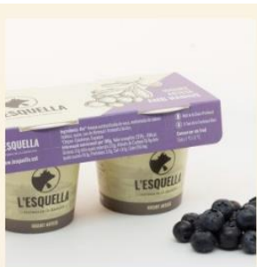
logurt amb Nabius