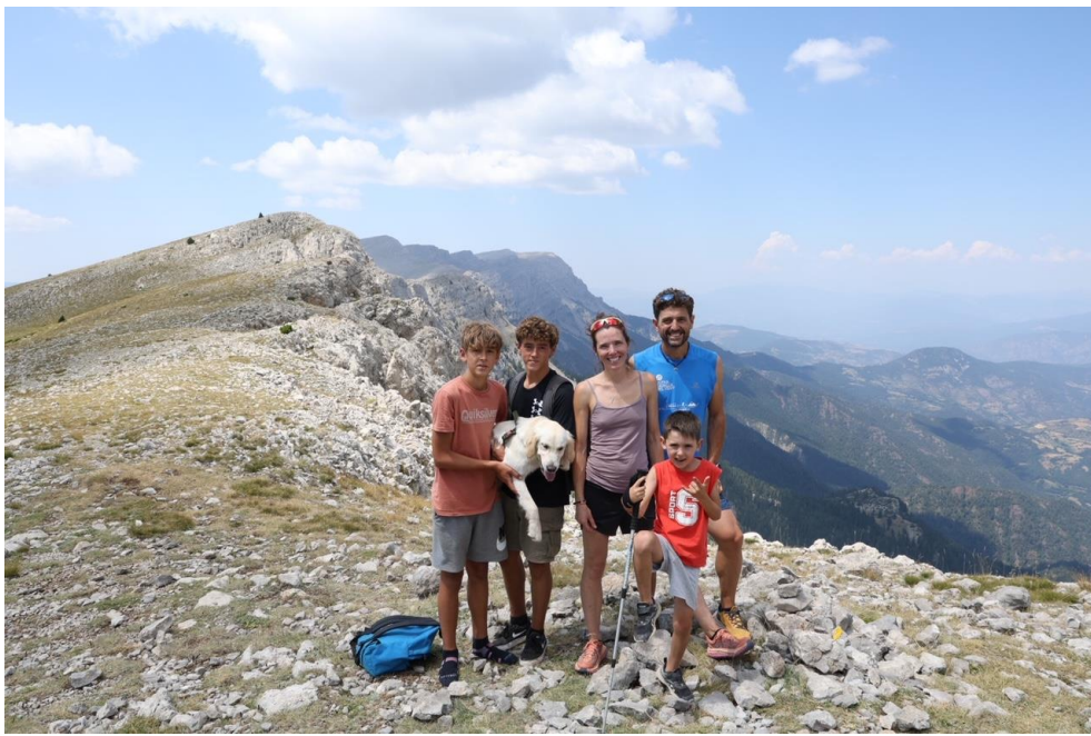
Pas dels Gosolans, Serralada del Cadí (Catalunya)