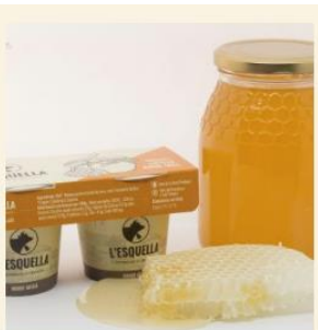
logurt amb Mel