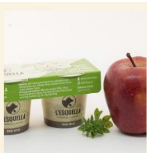
logurt amb Poma i Alfàbrega